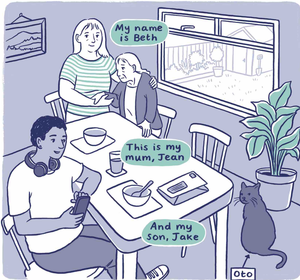
THE STORY OF GOOD SUPPORT AT WORK