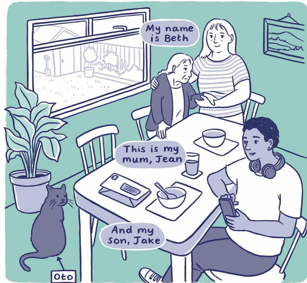
THE STORY OF NO SUPPORT AT WORK