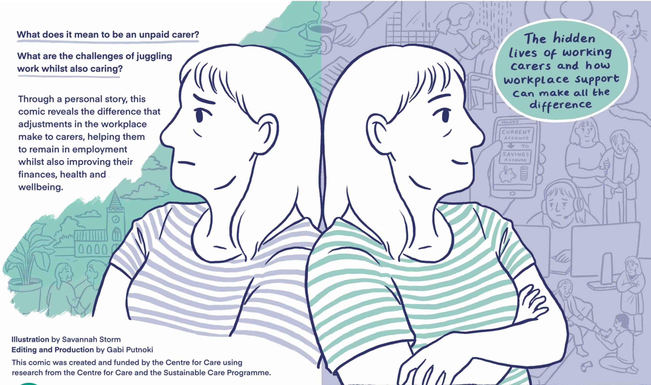
Illustration by Savannah Storm Editing and Production by Gabi Putnoki

The hidden lives of working carers and how workplace support can make all the difference